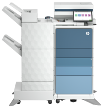
HP Color LaserJet Enterprise Flow MFP X677z+ Printer

This printer is intended to work only with cartridges that have a new or reused HP chip, and it uses dynamic security measures to block cartridges using a non-HP chip. Periodic firmware updates will maintain the effectiveness of these measures and block cartridges that previously worked. A reused HP chip enables the use of reused, remanufactured, and refilled cartridges. More at: http://www.hp.com/learn/ds