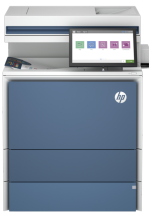
HP Color LaserJet Enterprise Flow MFP X57945z Printer

This printer is intended to work only with cartridges that have a new or reused HP chip, and it uses dynamic security measures to block cartridges using a non-HP chip. Periodic firmware updates will maintain the effectiveness of these measures and block cartridges that previously worked. A reused HP chip enables the use of reused, remanufactured, and refilled cartridges. More at: http://www.hp.com/learn/ds