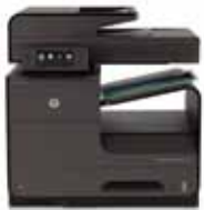
(HP Officejet Pro X476dn color MFP)