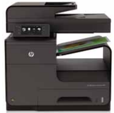
(HP Officejet Pro X576dw color MFP)

The next generation of printing is here. Print professional-quality color—up to twice the speed 1 and half the cost per page of color lasers 2 —using HP PageWide Technology. Help workgroups thrive with versatile functions and easy manageability.