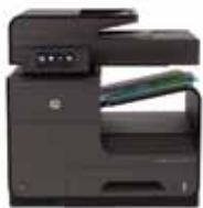
(HP Officejet Pro X476dw color MFP)